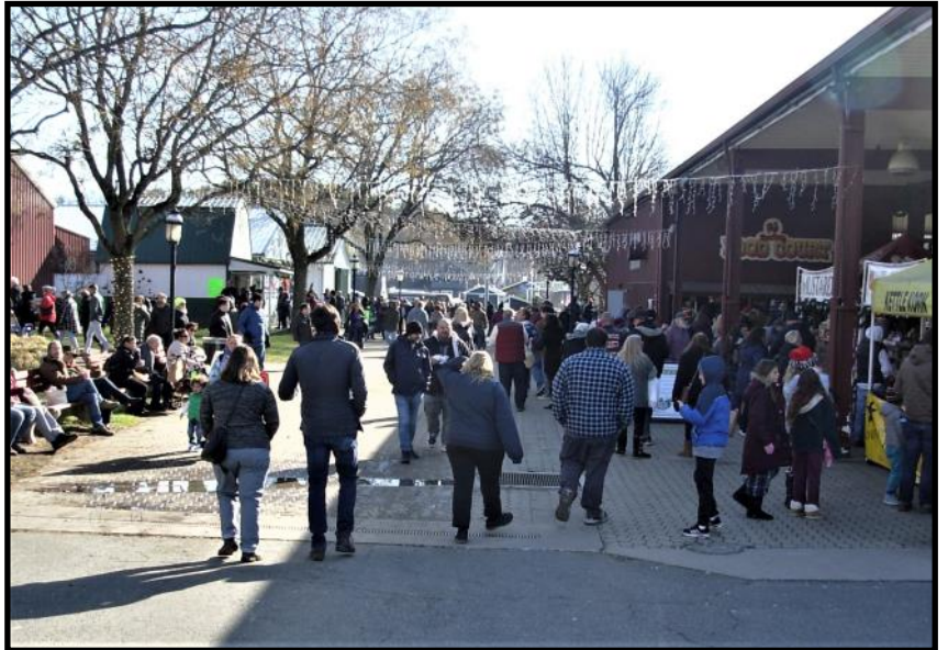
An excellent turnout for the event!