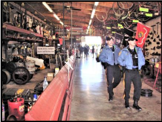
High traffic in the shed and peanut sales were excellent!

AT the FAIRGROUND December 2nd, 3rd & 4th 2022 The shed was open on Friday and Sunday...weather was poor on Saturday!